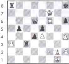
I. Siyah kazanır.